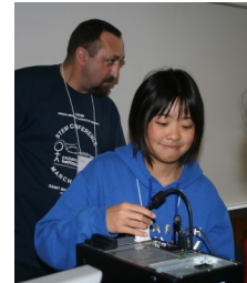
Hands on computer building