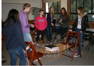
Building Bridges that work!