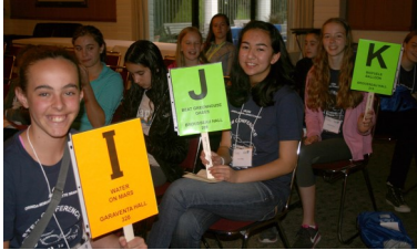
Former TT girls help out

EYH is a national organization whose goal is to promote STEM by holding conferences for middle school girls at local colleges. There are over 100 conferences nation-wide. Conference co-sponsors included Chevron and Lamorinda Sunrise Rotary among others. For more information, visit the AAUW-OML website: oml-ca.aauw.net .