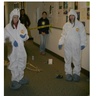
FBI Crime Scene Investigation

"I loved learning and meeting new people. I also like the pen and the brownie."